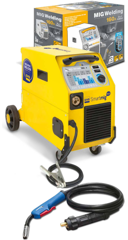
Earth Clamp and 2.2m EURO torch included.

Constant running fan protects unit against overheating.